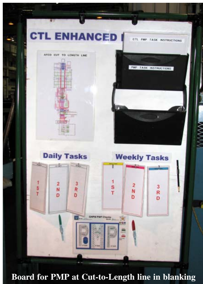
Board for PMP at Cut-to-Length line in blanking

Many of you are probably wondering why we do PMP (Production Maintenance Partnership). Well, PMP ensures a safe, neat, clean, and organized workplace. PMP also helps us reduce losses from breakdowns, quality and throughput issues. PMP helps the company use the operator's knowledge and skills in maintaining their equipment. PMP also helps us better utilize the skilled trades person's knowledge and skills to improve the reliability and maintainability of our equipment.