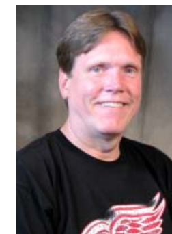
Gary Bentfield Metal Assembly